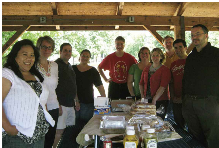
Members of the Chorus and friends at Tilles Park